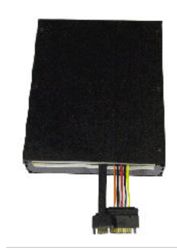
step 4 Put your HDD into SMART DRIVE properly. Then you will see that the connectors are pressing SMART DRIVE's shockabsorber as on the picture "step 6", but it is correct.