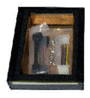
Make sure the cables are all the way seated properly.